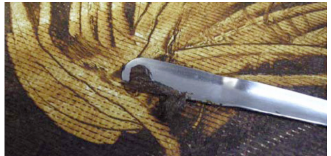
Effective at removing organic deposits