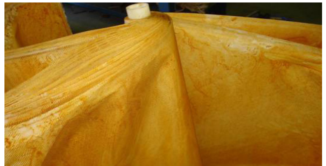
Removes Iron Deposits