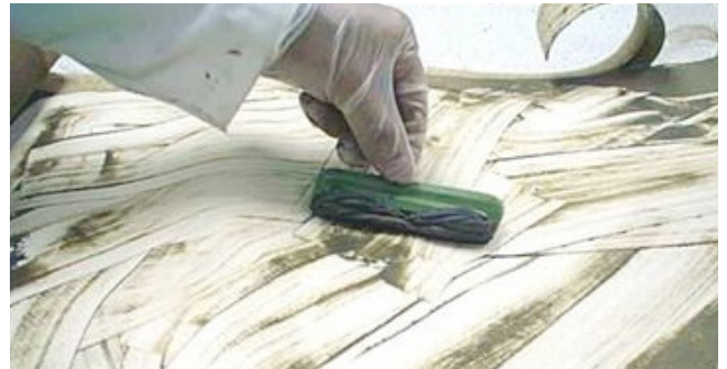
Removes Organic Fouling