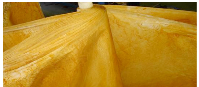
Prevents Iron Fouling